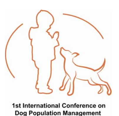
- 13 -