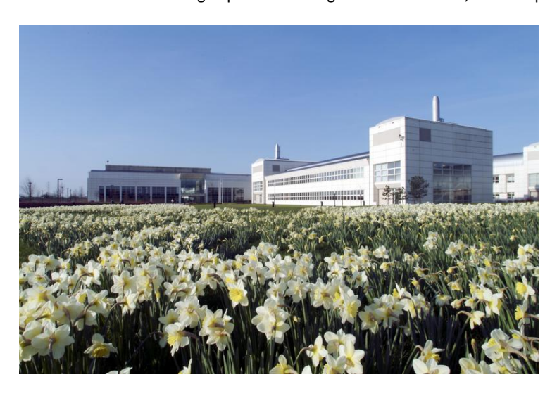
Fera – The Food and Environment Research Agency